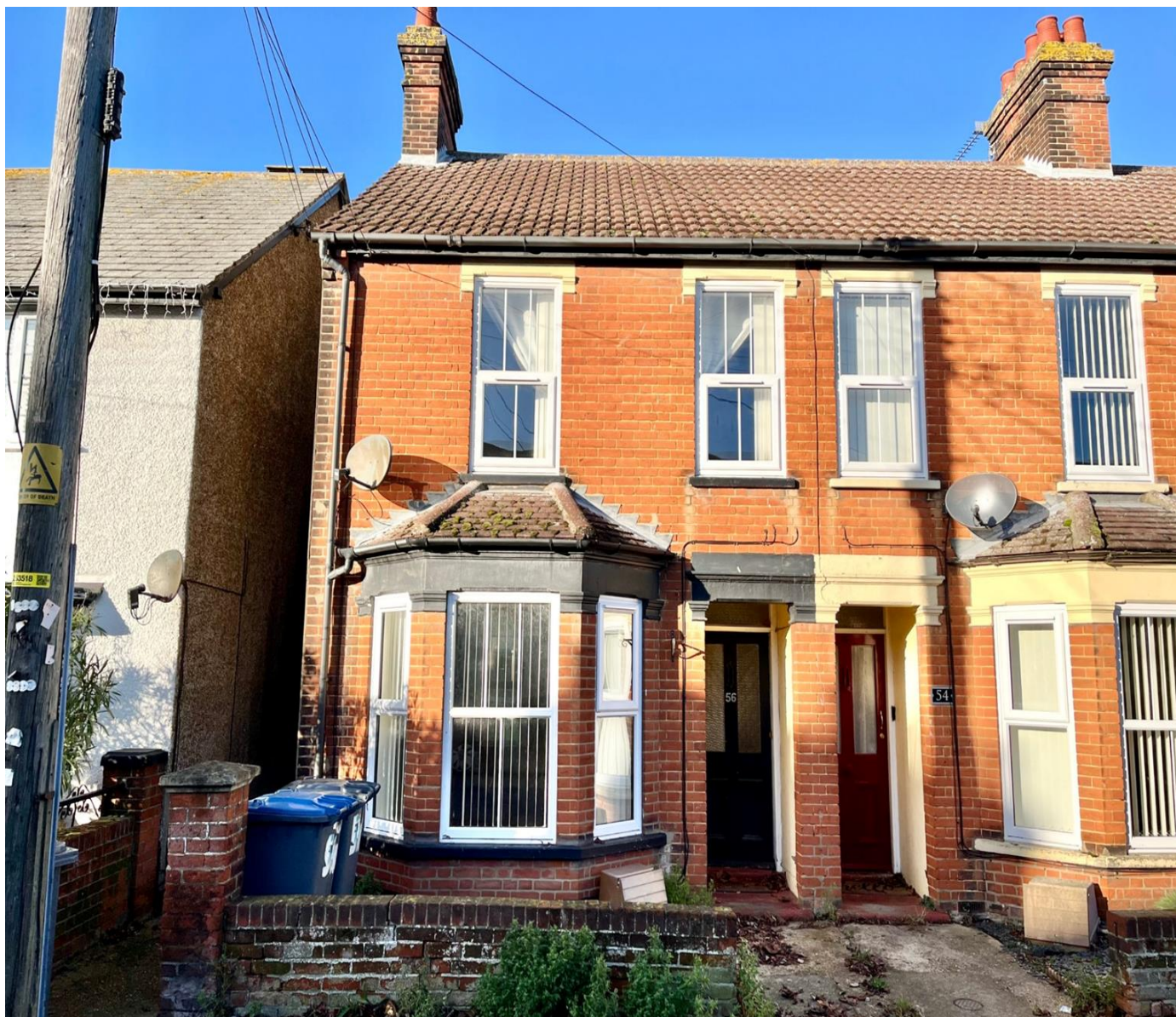
Maidstone Road, Felixstowe £235,000 Freehold Three bedroom end terrace house in Walton